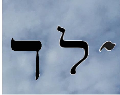
Yud Lamed Dalet: To give birth; son, boy; child