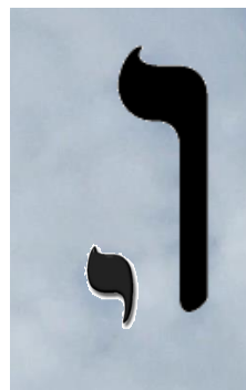
Vav Yud: “Oy Vey” an expression of terrible grief!